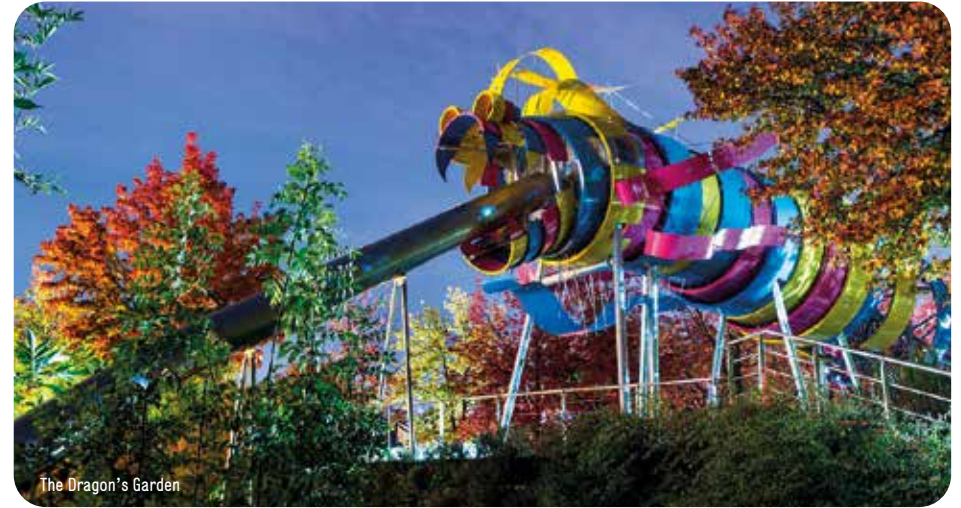
The Dragon's Garden