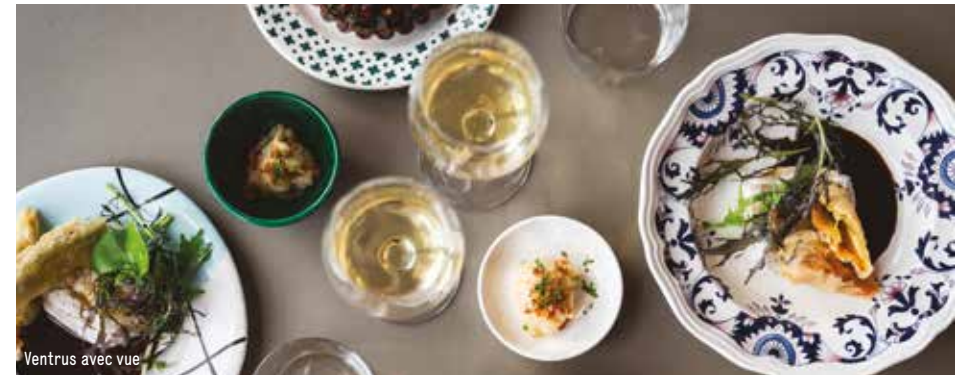
Ventrus avec vue