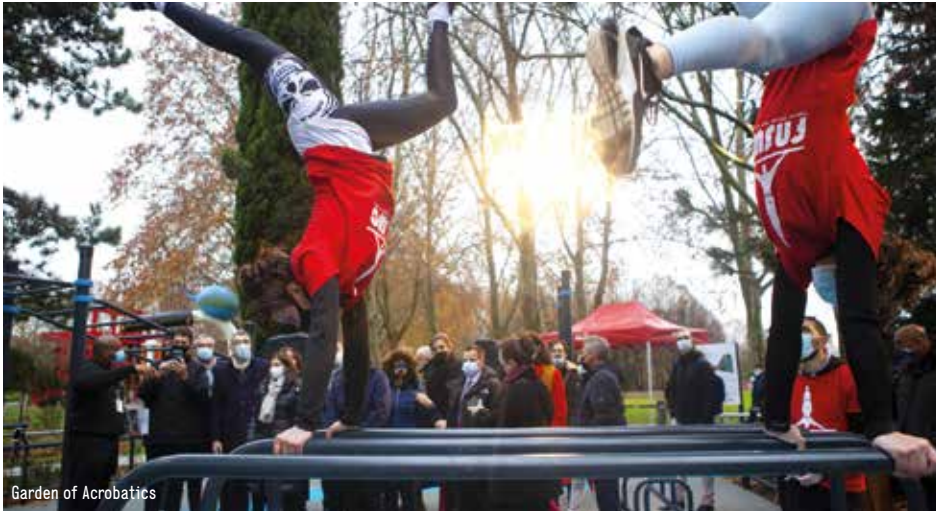
Garden of Acrobatics