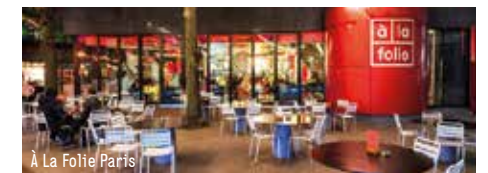
À La Folie Paris

Street food and bars Level -2 boomboomvillette.com