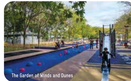
The Garden of Winds and Dunes

Not to forget the rides, including a beautiful carousel with a fire truck, carriages, and giraffes!