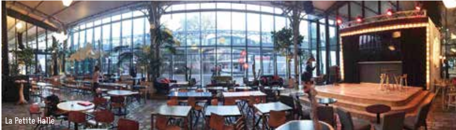
La Petite Halle