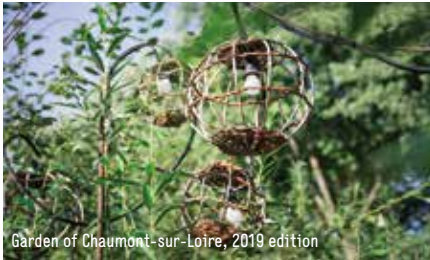
Garden of Chaumont-sur-Loire, 2019 edition